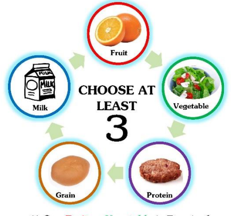
1/2 Cup Fruit or Vegetable is Required

*Students are required to take ½ cup of a fruit or vegetable to make a meal at breakfast and lunch.